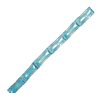
TECHKEWL™ Phase Change Cooling Neck Band – Replacement Insert