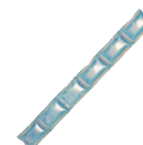
TECHKEWL™ Phase Change Cooling Deluxe Neck Band – Replacement Insert